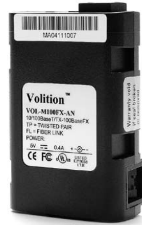
3M™ Volition™ Ethernet Media Converter

The media converter is shipped with an AC/DC switching power supply and is also capable of tapping power via the USB port on both desktop and laptop computers with the provided USB cable. The compact size of this media converter allows it to be stored out of the way of the user.